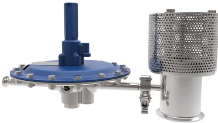
Model 1100 shown with Model 1088

The Model 1100 is a stainless steel sanitary vent designed to operate at multiple set points as a breather valve to avoid vacuum or over pressurization inside a tank or piping system. This unit comes with a true sanitary blanketing connection, and is designed so that it can be used with our sanitary blanketing valve; VCI model 1088.